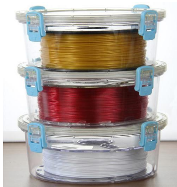
Filament storage container